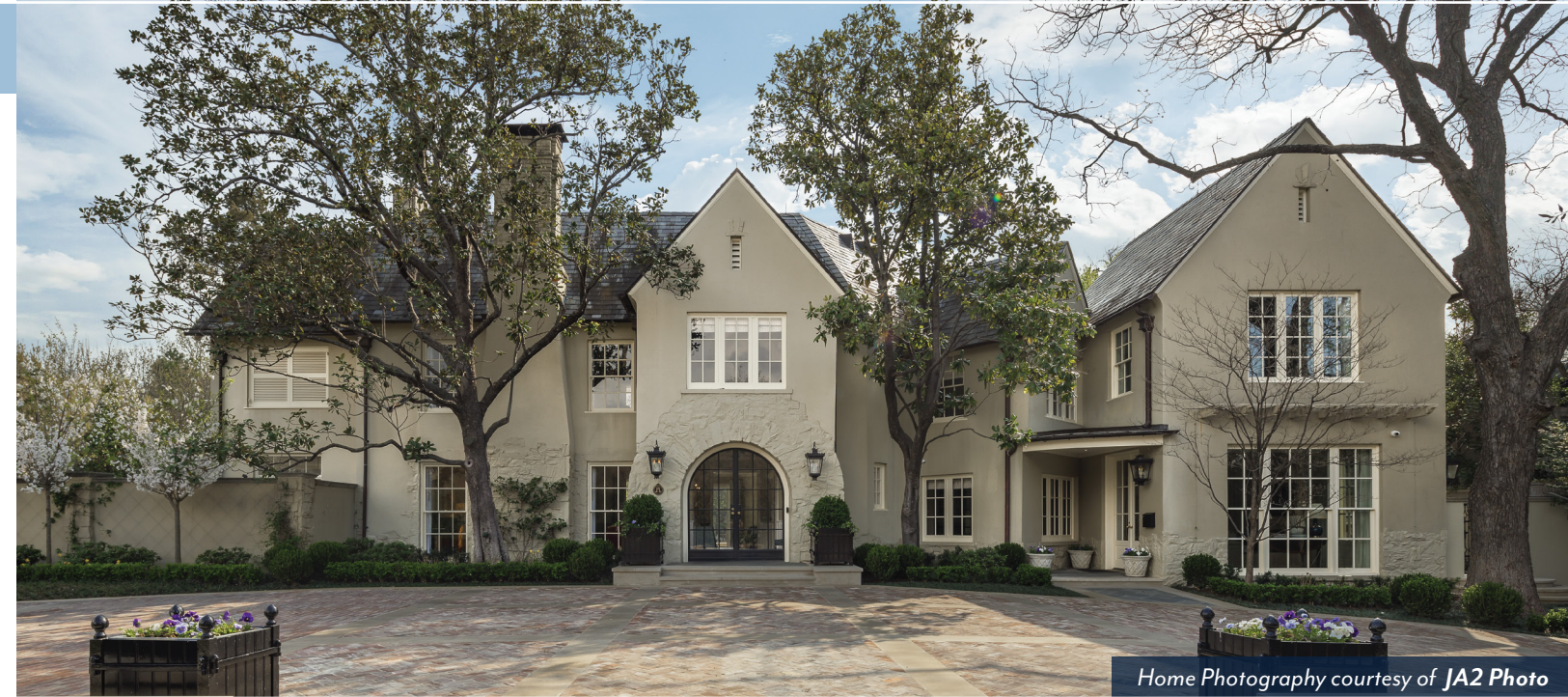
Home Photography courtesy of JA2 Photo

How fortunate the community is to celebrate this legendary home and its history. The Moss family comprehended the importance and legacy of such a home rather than viewing the location as a building site. What a stunning reminder of what can happen when new owners understand that extraordinary architectural talent conceived and constructed many of Highland Park's masterpieces.