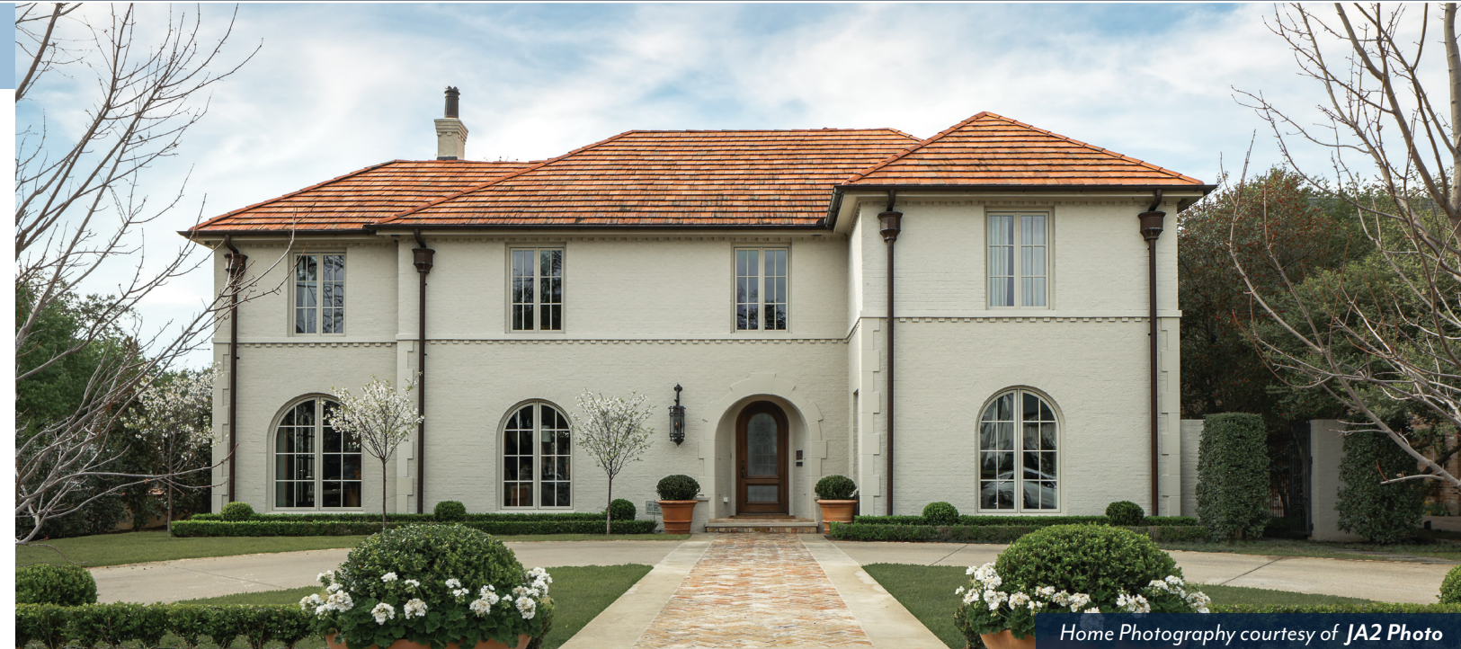
Home Photography courtesy of JA2 Photo

Carolyn Isler has an extraordinary talent for blending rare, exquisite antique artifacts with equally exceptional mid-century furniture, art, and appointments. The layered character of each room in this home is genuinely indescribable. Additionally, the stunning 2 story guesthouse, located at the rear of the property is a perfect companion piece. From the roof top to the foundation, the transformation of this home is testimony of how a talented visionary can achieve an incomparable result.